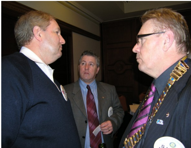
It IS your shout!